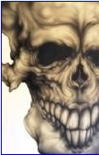
"Harvest of Skulls," Alameda Journal

That brings me to the favor: Someone was kind enough to nominate me for "Best Local Blogger" in the ABC 7 Bay Area A-List, and I'm currently one of the top nominees! Would you please consider voting for me by March 30? Here are links to some representative articles if you'd like to have a look.