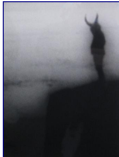
"Raven Rainbow," Postdiluvian Photo