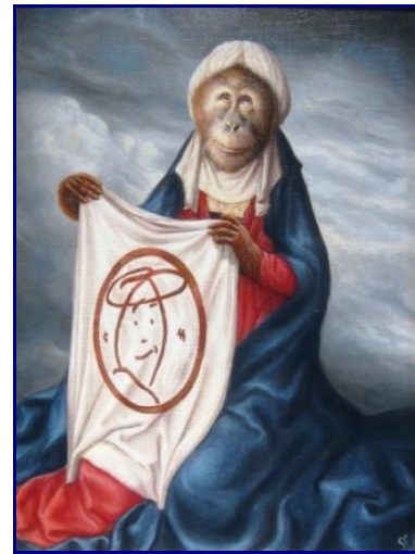
"I'm with Stupid," The Island