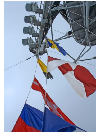
"Flags" (USS Hornet)