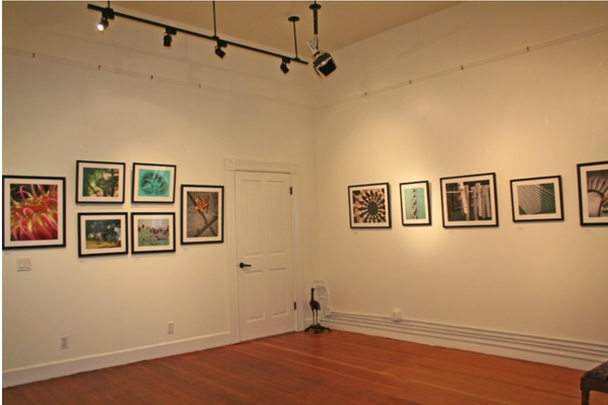
Two walls from "In Plain Sight" at the Frank Bette Center for the Arts

Hello! The biggest news since my last newsletter is that my solo show, "In Plain Sight," took place at the Frank Bette Center for the Arts from February 2-25. It was a lot of work hanging 18 pieces (with another 18 matted photos in the bins), but I was really pleased with the result and very appreciative of the turnout and feedback the show received.