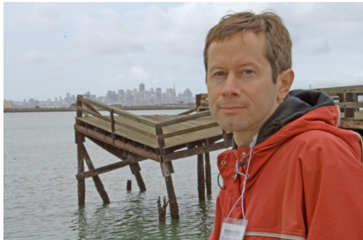
On location shooting "Alameda on Camera" (self-portrait)

As I mentioned in the last newsletter, I had applied to "Alameda on Camera - A Photo Documentary," a juried event at the Frank Bette Center. I was one of forty photographers chosen to take part, taking photos of a randomly assigned geographic region in Alameda the weekend of February 24-25. I was assigned the USS Hornet and surrounding area on the former Naval Air Station. It was cold and wet, but still a lot of fun. A few of the photos I took that weekend are shown here. The show is currently at the Frank Bette Center and will run through April 29.