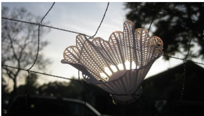
"Bye, Birdie" (2010)